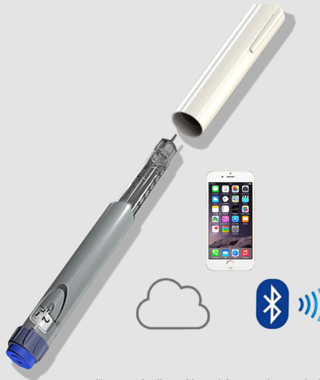
Intelligent cap for disposable pen injectors to keep track of and precisely monitor drug administration