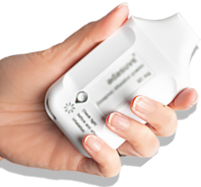
Hand-held drug inhalator with aspiration detection to deliver accurate drug quantity