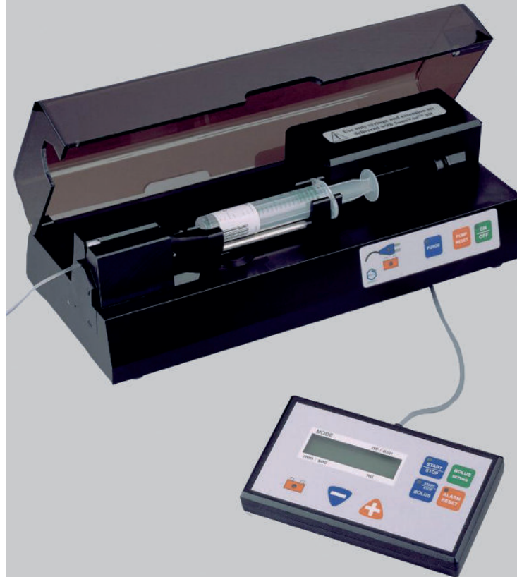
High-precision and remote controlled contrast syringe pump