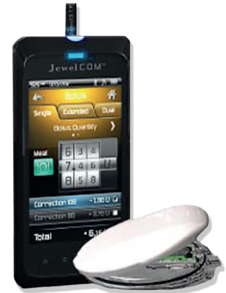
Pump for continuous insulin infusion & controller with dedicated smartphone device